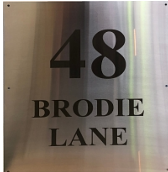
Laser Etched House Sign