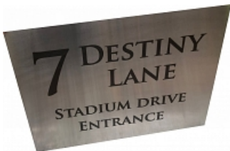
Laser Etched House Sign