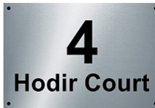
300 x 200mm House Sign