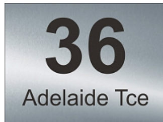
400 x 300mm House Sign