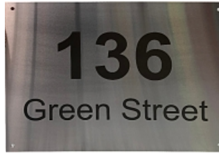
Laser Etched House Sign