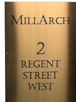
Brass Finish on Stainless Steel