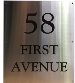
Laser Etched House Sign