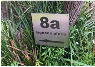
Laser Etched House Sign