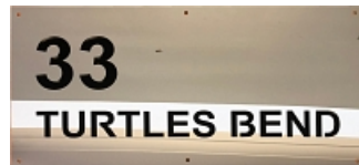
Stencil Cut Mirror Finish House Sign