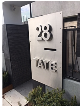
3D fabricated with LED