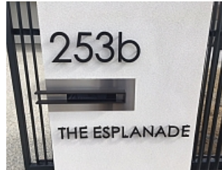
Laser Cut Letters and Numbers