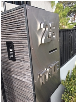
3D fabricated with LED