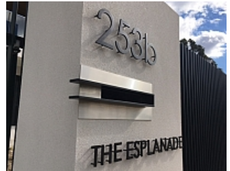
Laser Cut Letters and Numbers