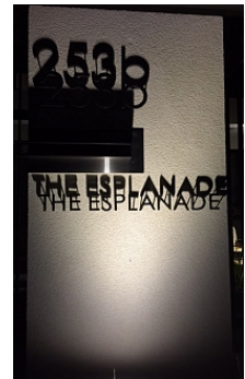
Laser Cut Letters and Numbers at Night