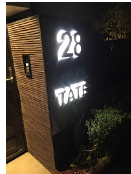
3D fabricated with LED