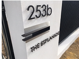
Laser Cut Letters and Numbers