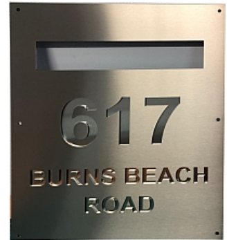
Laser Cut Stencil Letters and Numbers, Stainless Background