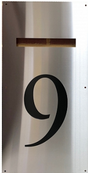
Laser Cut Stencil Letters and Numbers, Stainless Background